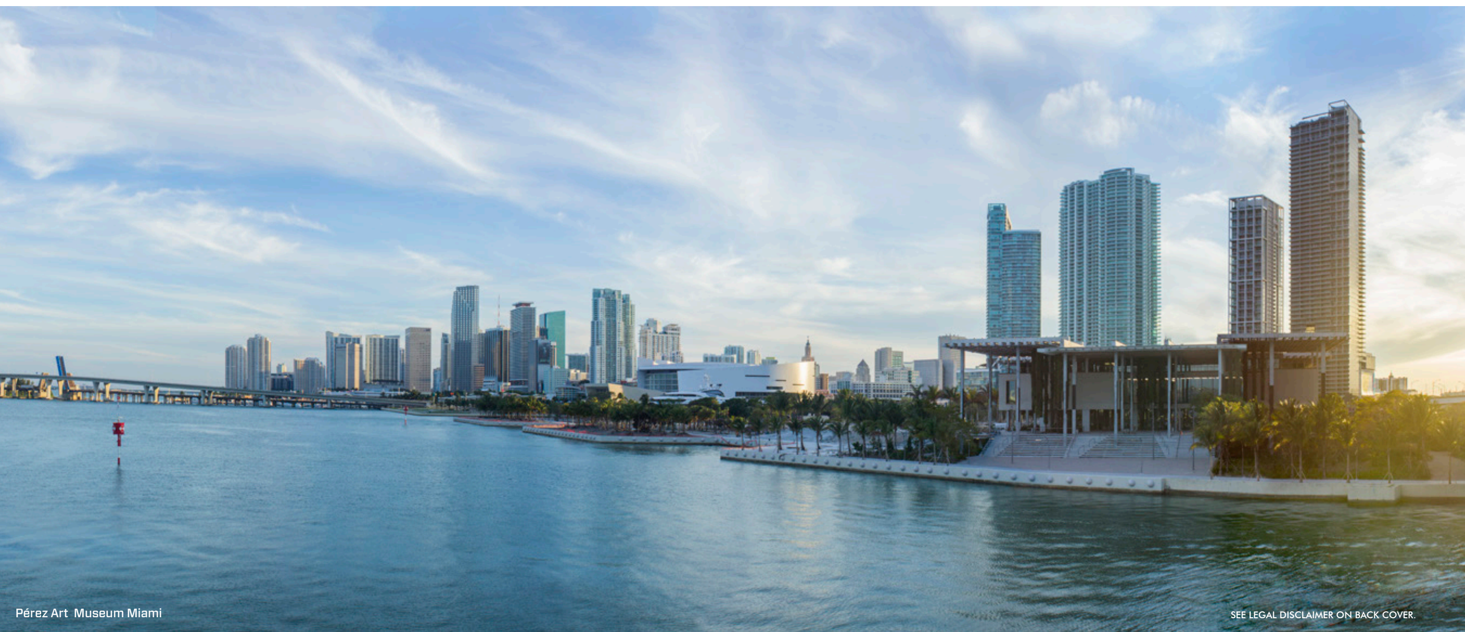
Pérez Art Museum Miami