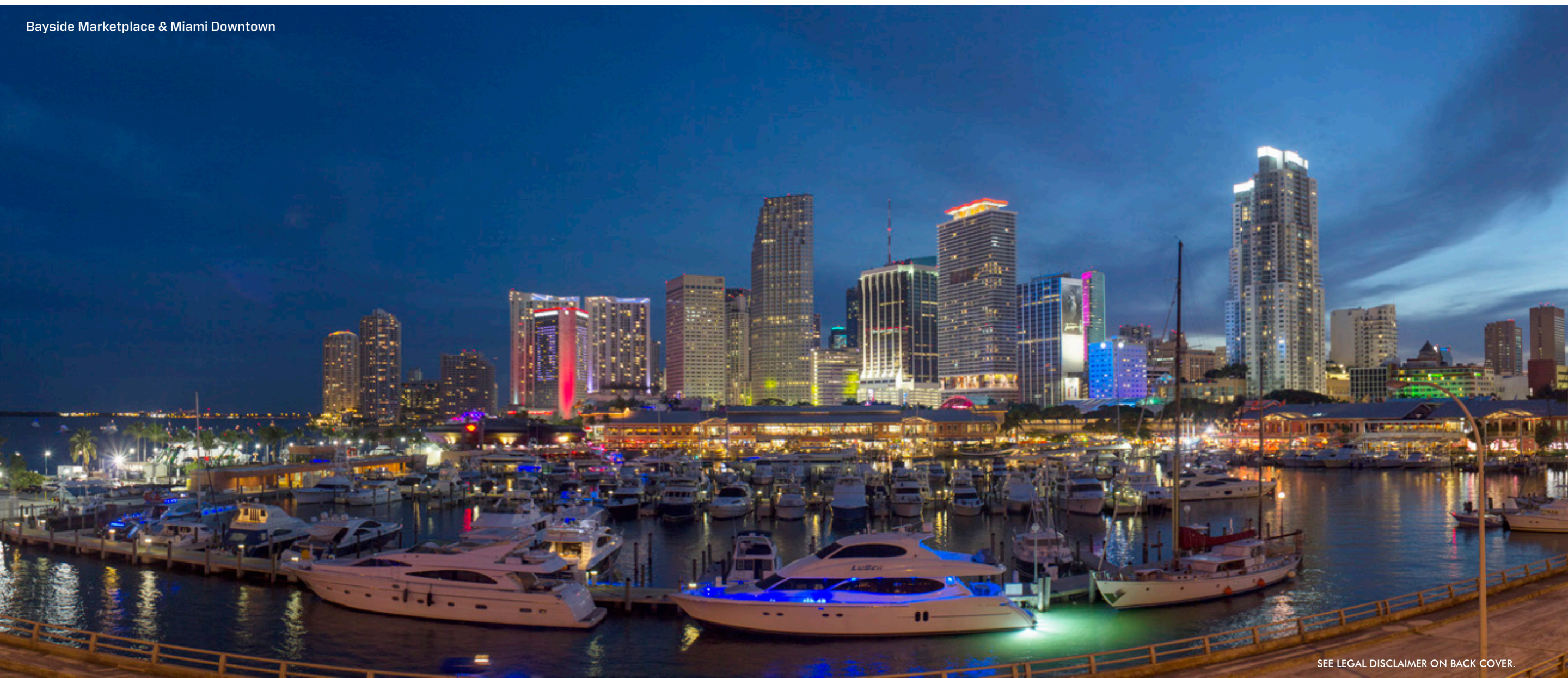
Bayside Marketplace & Miami Downtown